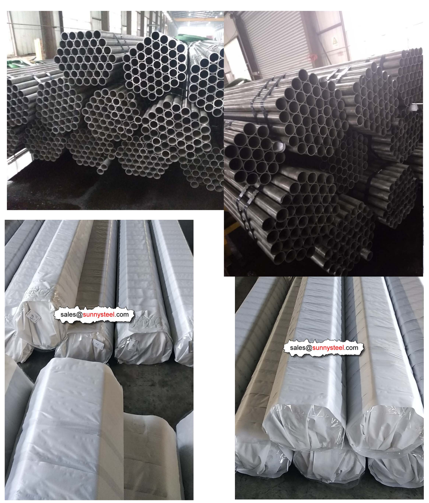
--- www.sunnysteel.com ---